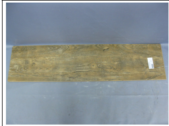
Test sample (back View)