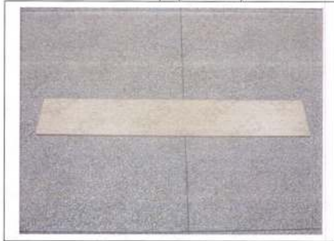
Test sample(back view)

(FORTHFLOOR MASTER AC3 2011/05/10 14:50:39 42)