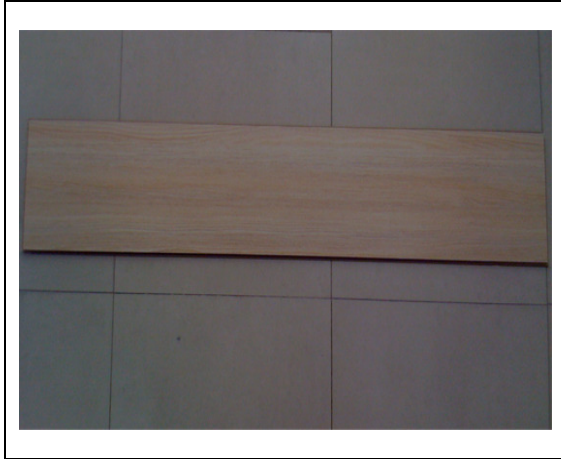
Test sample (front View)