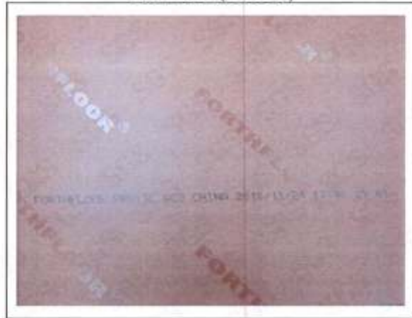
Back view (Lote 61)