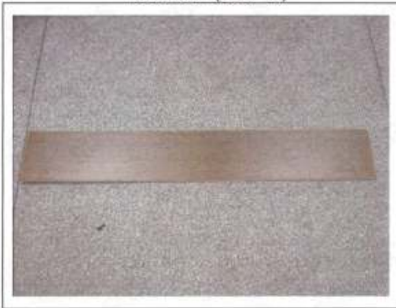
Front view (Lote 40)