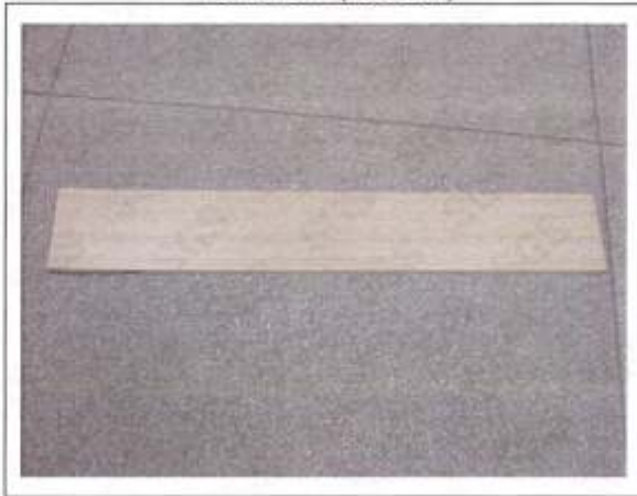
Front view (Lote 61)